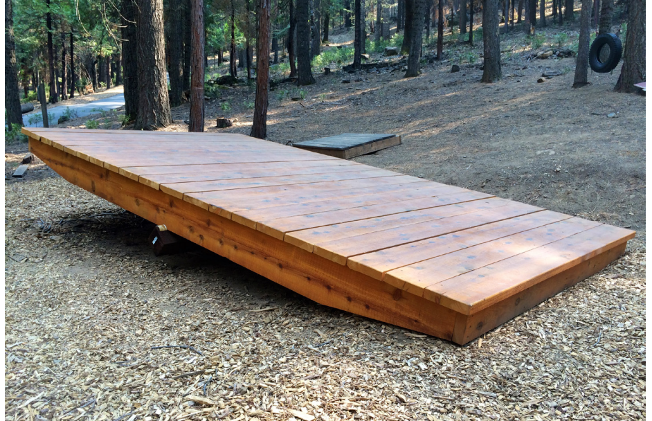
New Whale Watch Activity

We will soon be adding a Great Wall, a spider web and a lowering counter-balance device to the zip line. We are excited about the continuing improvement to the outdoor education program.