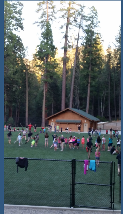
The first campers and staff on the new Recreational field

With the field's completion in June, campers are now able to use it for any number of activities. The new field is a major improvement for Camp Wawona, which originally used its horse corrals for sports activities. Conference leaders anticipate that everyone who uses the field will be able to reconnect to God spiritually through the beauty of nature.